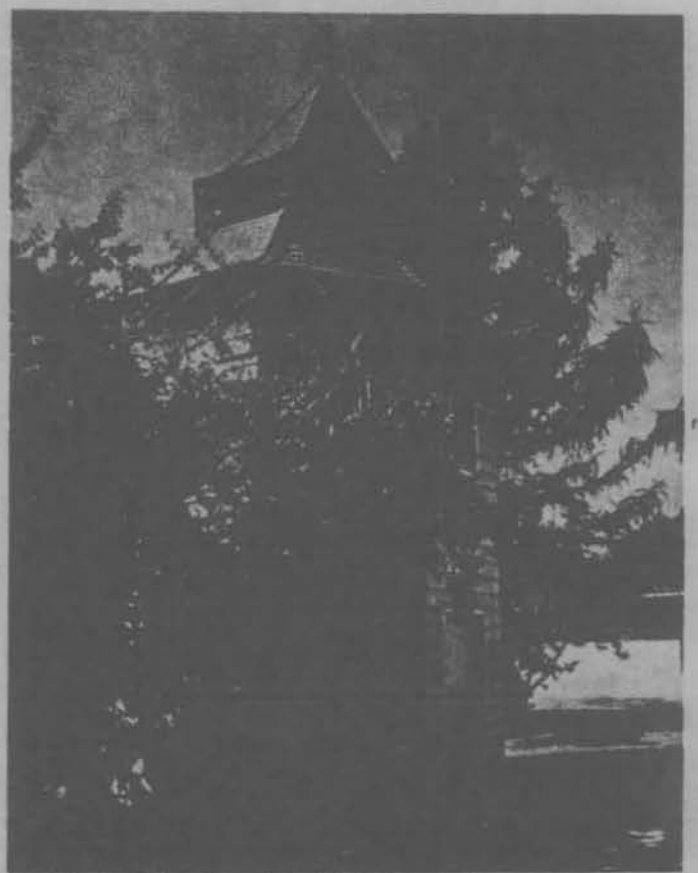
The buildings at the old Ayrilawn Farms in North Bethesda had great style, as this surviving silo shows.