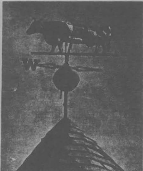
The weathervane atop a second silo symbolizes the Ayrilawn claim to fame—prize Jersey cows.