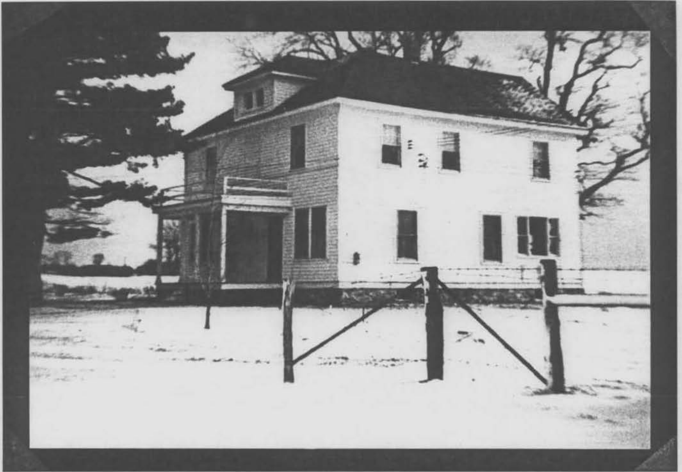
1955 View of Darne-Purdum Farmhouse