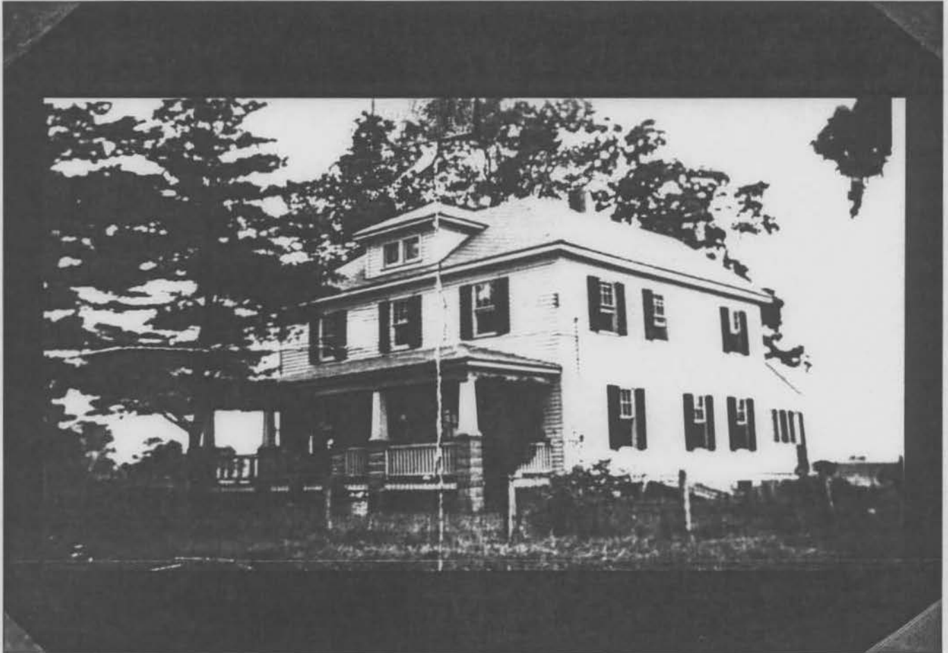
1927 View of Darne-Purdum Farmhouse